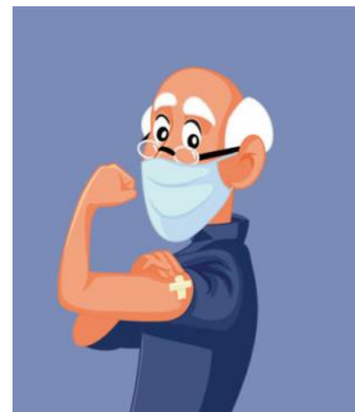
Ringwood Ex-Tabler preparing for winter