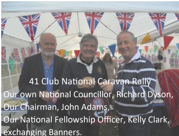
41 Club National Caravan Rally